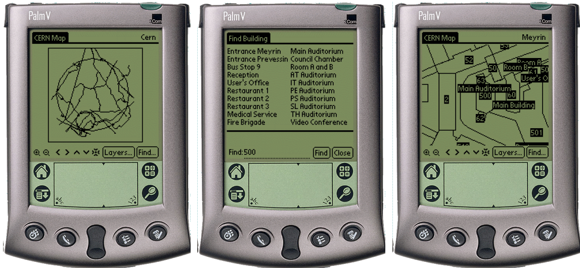
Figure 3: The Building and Map interface on a Palm V. On the left the initial screen showing the CERN site, clicking anywhere on the map will zoom in and show more detail. In the middle the lookup screen, allowing users to find common places and to look up building numbers, and on the right the result of a lookup of building 500, which can be scaled and panned interactively.

All PostScript maps run through a converter, using a standard Java environment on Windows or Unix, which builds a database for the Palm using the PDB format[12]. The converter compresses around 4.5 Mbytes of PostScript into a specific map PDB of 80 Kbytes. This database contains building names and numbers, coordinates of their location and all maps in the form of vectors, split up in several layers. The database format and record order is shown in Table 2, while the different record formats are shown in Tables 3-8.